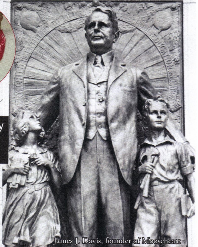
James J. Davis, founder of Mooseheart

Please wear your Donors Circle pin proudly and share the story of Mooseheart & Moosehaven at every opportunity.